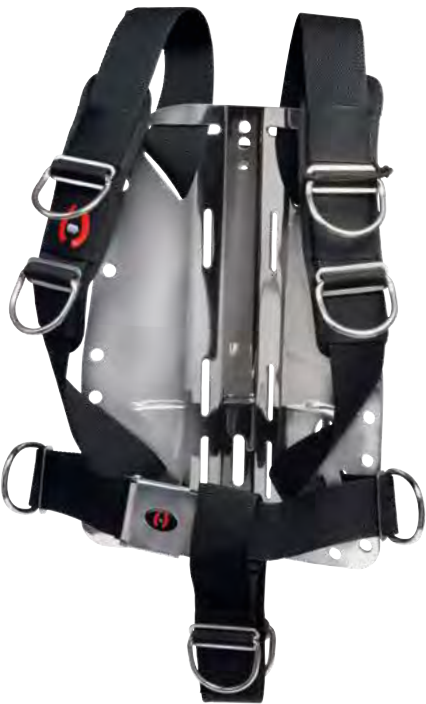
Backplate Available Separately