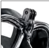
GoPro mount included with M3 Mask