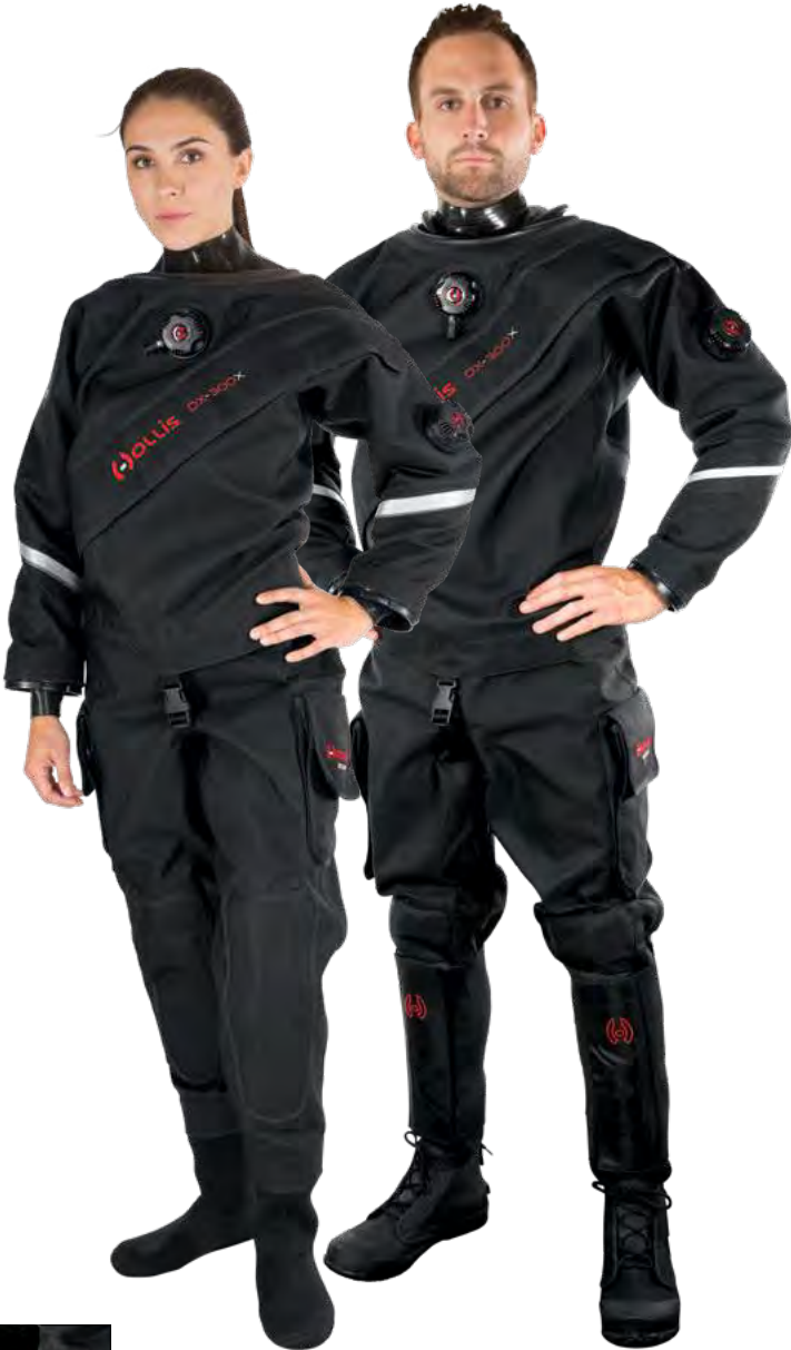
Photo shows Drysuit Gaiters and Canvas Overboots on him. Each sold separately.