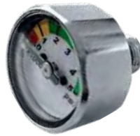
PONY BOTTLE GAUGE