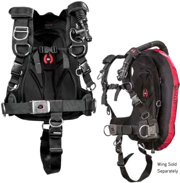
Wing Sold Separately