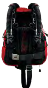
SMS 100 DUAL