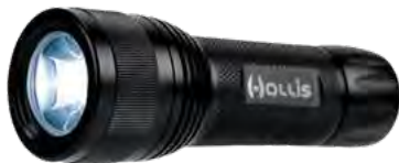
LED MINI 3