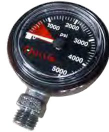
LOW-PROFILE BRASS SPG