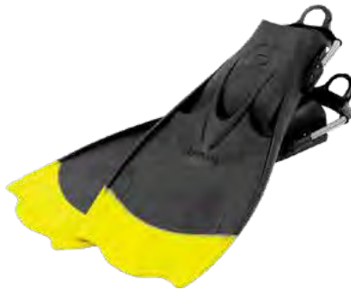
F1 YELLOW TIP