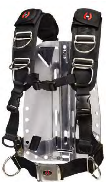
Backplate Available Separately