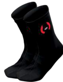
AUG 260 SOCKS