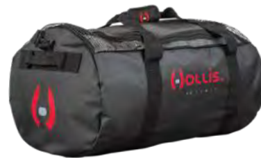
MESH DUFFEL BAG