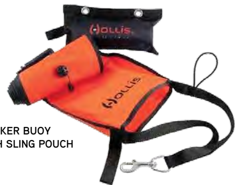
MARKER BUOY WITH SLING POUCH

Buoy is covered by a 12 month limited warranty