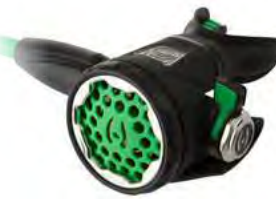
150 LX H02