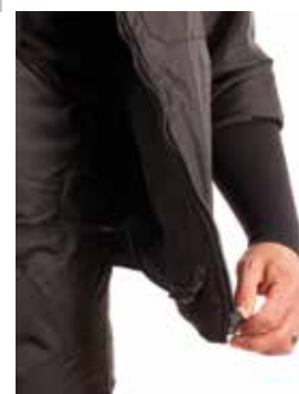
Zipped removable smock