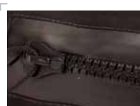
Dry plastic zip