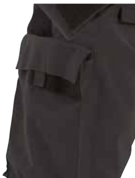
Fixed bellows pocket

All of the above available with Glide skin (Neoprene) neck and cuff seals as well as various footwear.