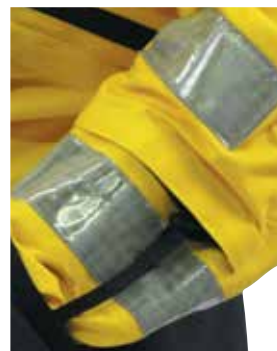
SOLAS approved reflective tape (only on SOLAS approved model)