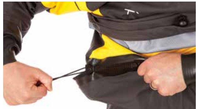
Plastic Aquaseal zip