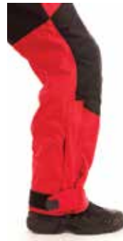
Cordura overlay knee and adjustable lower ankle