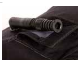
Oral inflation/deflation valve