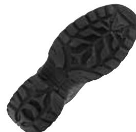
Water Spider in Black