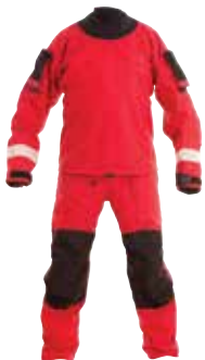
Smock and trouser combo