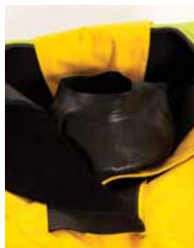
SOLAS WOSS integrated hood and collar