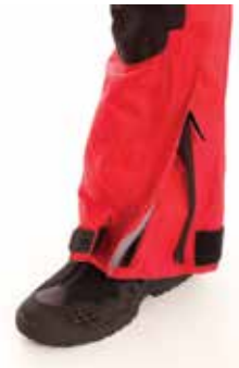
Lower leg zip with storm flap