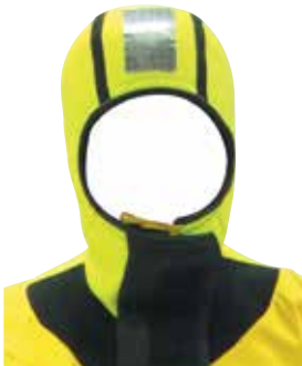
Roll-down Neoprene hood

XS, S, SM, M, MB, LM, L, LB, XL, XXL, Made to measure