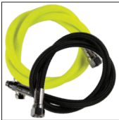
Miflex® Braided Hose