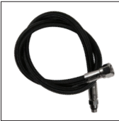
Miflex® Braided Hose