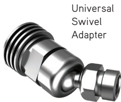
Universal Swivel Adapter