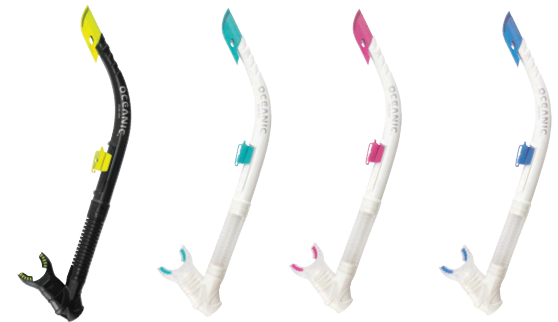
Black/Neon-Yellow Clear/Sea Blue White/Pink White/Oceanic Blue