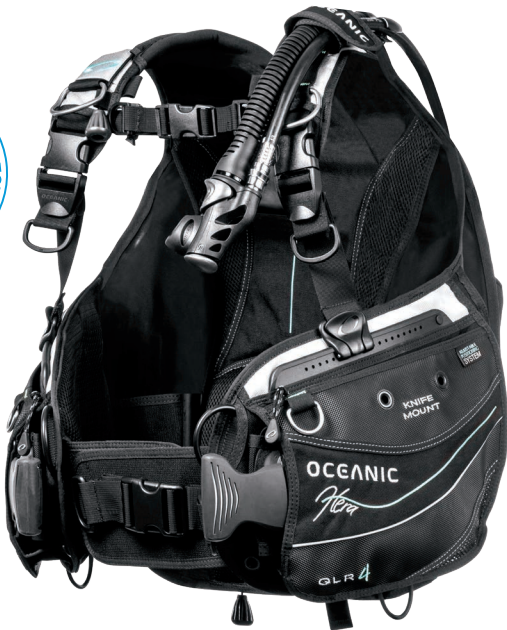
QLR4 Patent 6,487,761