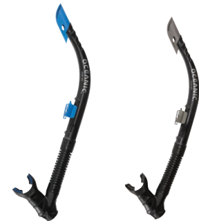
Black/Oceanic Blue Black/Titanium