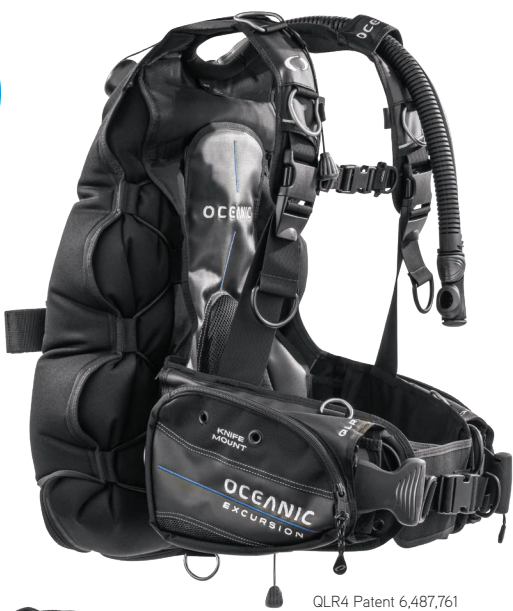
QLR4 Patent 6,487,761