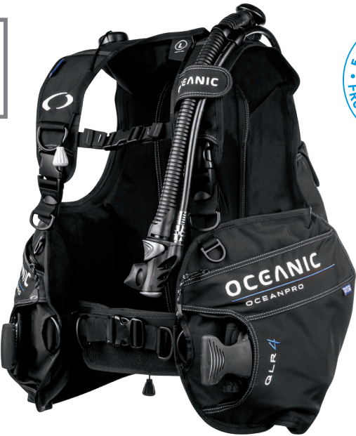
Shown with optional QLR4 weight pockets