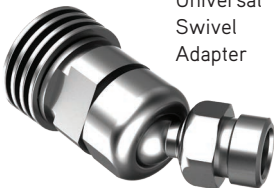
Universal Swivel Adapter